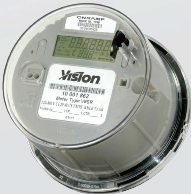
Vision XT Version

At Vision Metering, customer input has dictated the specifications upon which our meters were designed and manufactured. Our meters continue to evolve based on the expectations of our customers.