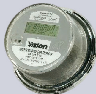
Vision & Vision LT